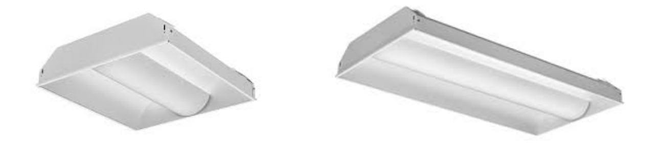
Step 2: Remove the existing linear fluorescent tubes and properly dispose of them.

Step 3: Remove the center channel cover to expose the fluorescent ballast(s). Set aside and properly dispose.