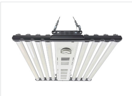
Commercial High Bay (CH3)