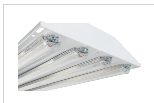
High Performance Low Bay (HPL)