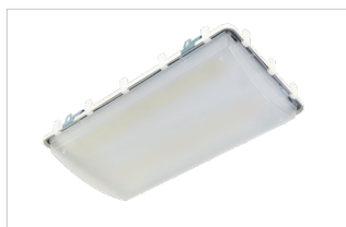
Hosedown 2.0 (HD2)