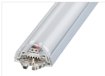
Universal Retrofit System (URS-ECO)