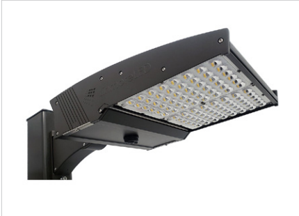
Site Lighter Area Light (SL2)

Committed to deliver the best quality BAA products while contributing to American jobs.