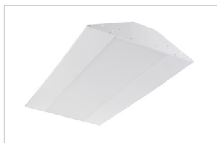
High Output Troffer (HT1)