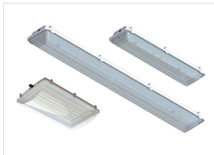
Hosedown 2.0 Series (HD2)