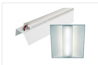
Center Basket Retrofit Kit (ARK)