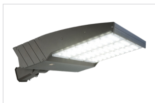
Site Lighter (SL1)

Committed to deliver the best quality BAA products while contributing to American jobs.