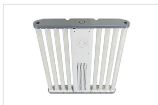
Essentials 5 (ES5)