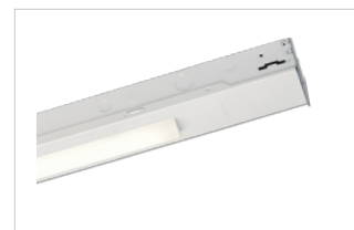
Linear 2.0 (LR2)