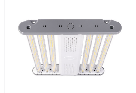
Essential Series 4.0 (ES4)