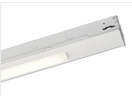
Linear 3.0 (LR3)