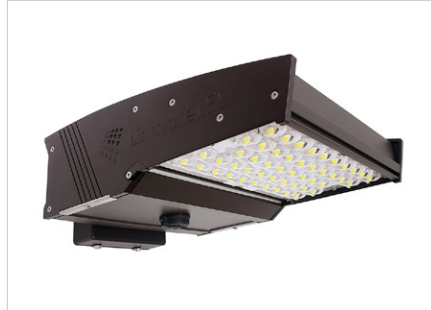
Site Lighter Wall Pack (SLW2)