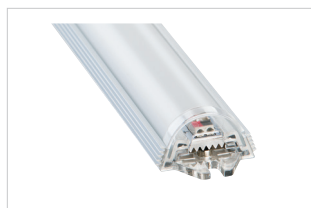
Universal Retrofit System (URS) & (URS -ECO)