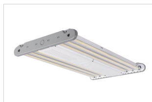
Essentials Series 4.0 (ES4)