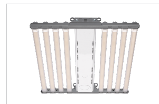
Commercial High Bay (CH2)