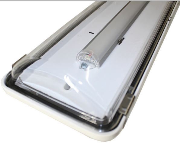
Clear Lens (4' Only)

Linmore LED Labs Vapor Tight Strip Fixtures (VTS) are a powerful connection of an IP67 Rated Enclosure and Linmore LED's powerful URS Light Bars delivering 152 lumens/watt. The patent pending URS Light Bar is comprised of the highest efficacy LEDs mechanically bonded to an extruded aluminum light bar with a 94% transmissive diffuser providing glare reduction and even distribution. The amount of light and the consistent distribution of light per watt of energy consumed is unmatched by any other vapor tight fixture. When the objective is to utilize a Vapor Tight fixture with the least amount of energy, the least amount of maintenance, best warranty, and designed for decades of effective life, the Linmore Vapor Tight Strip is the clear choice.